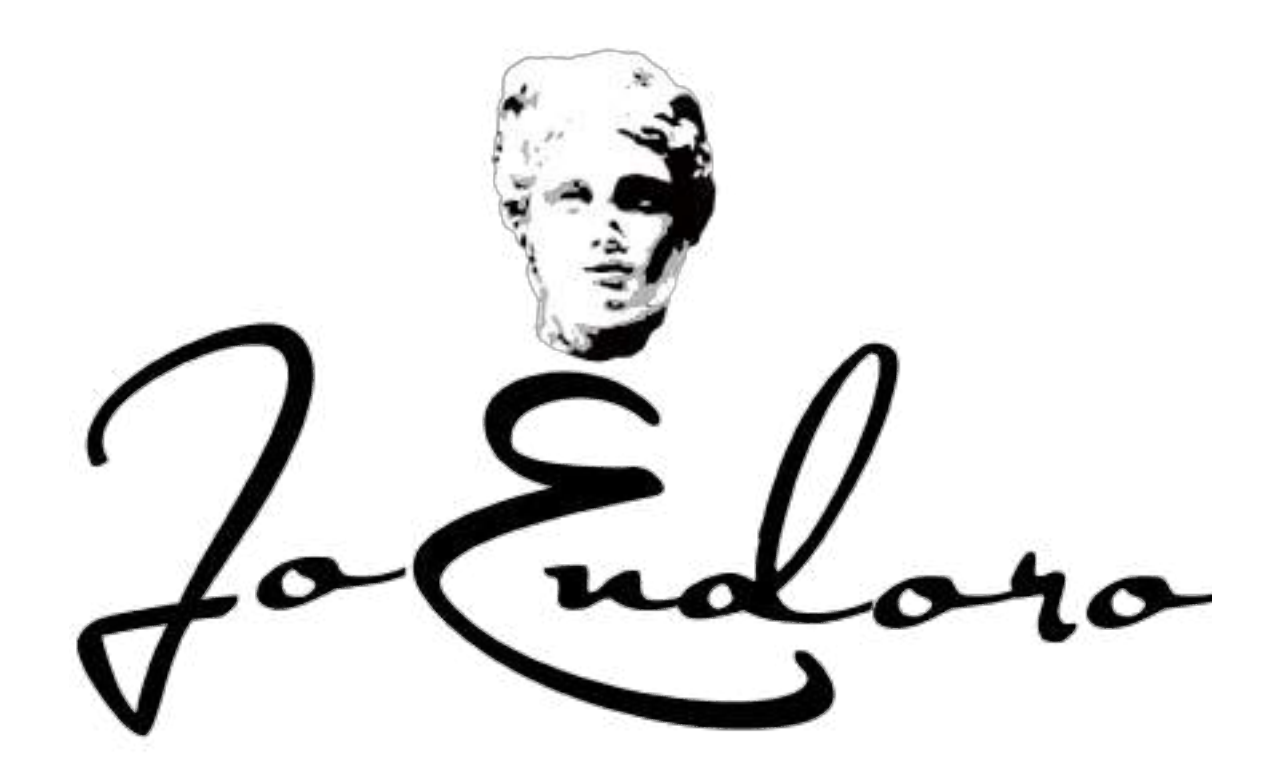
PIETRASANTA – MILANO – CASA DE CAMPO – MIAMI