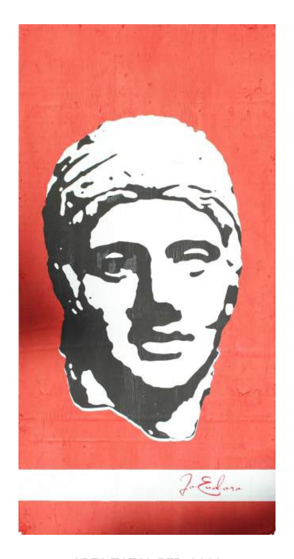
ARES TOTAL RED, 2022 mixed on wood, 122x244cm #2022CDC509