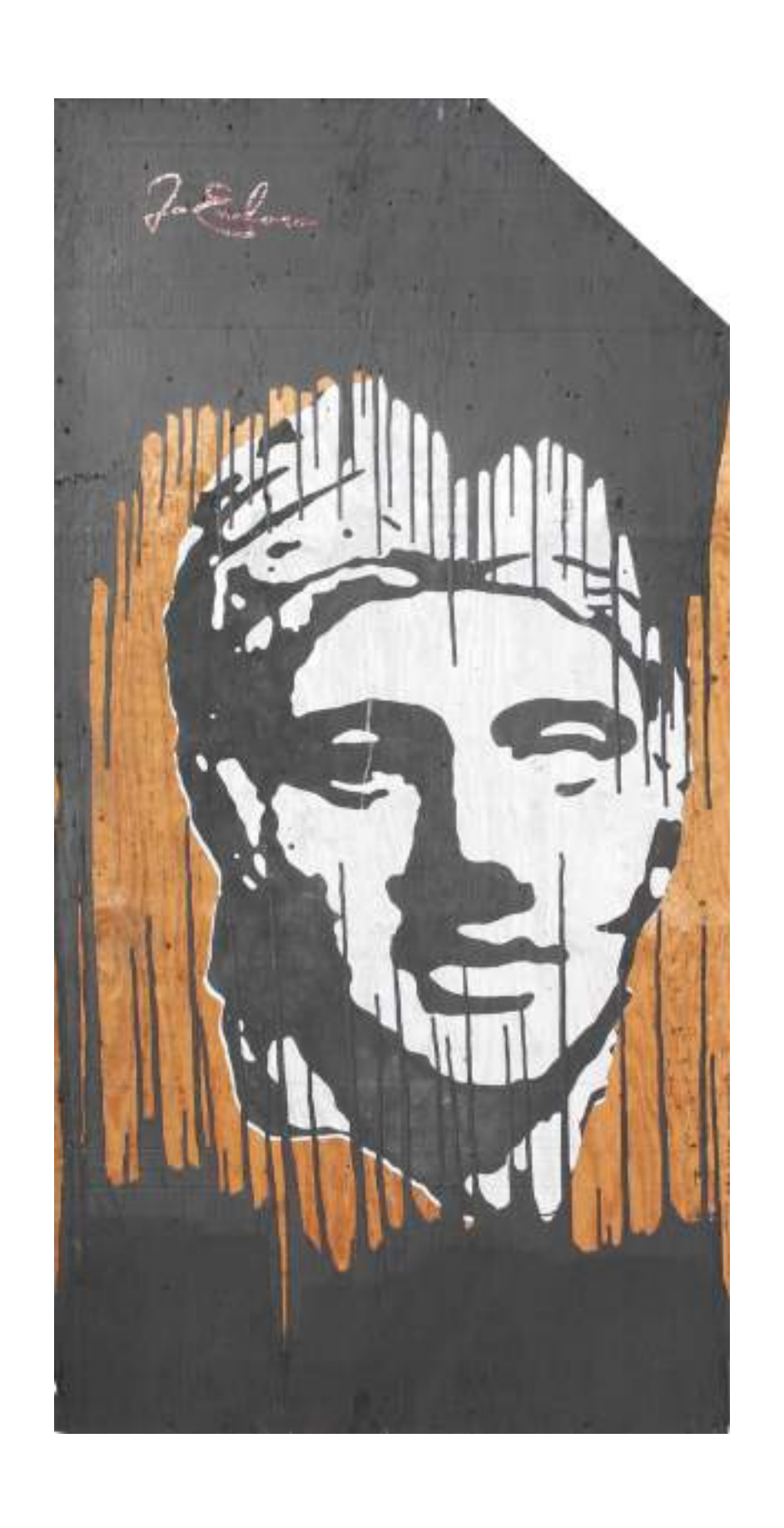
ARES BLACK 2022 mixed on wood, 122x244cm #2022CDC508