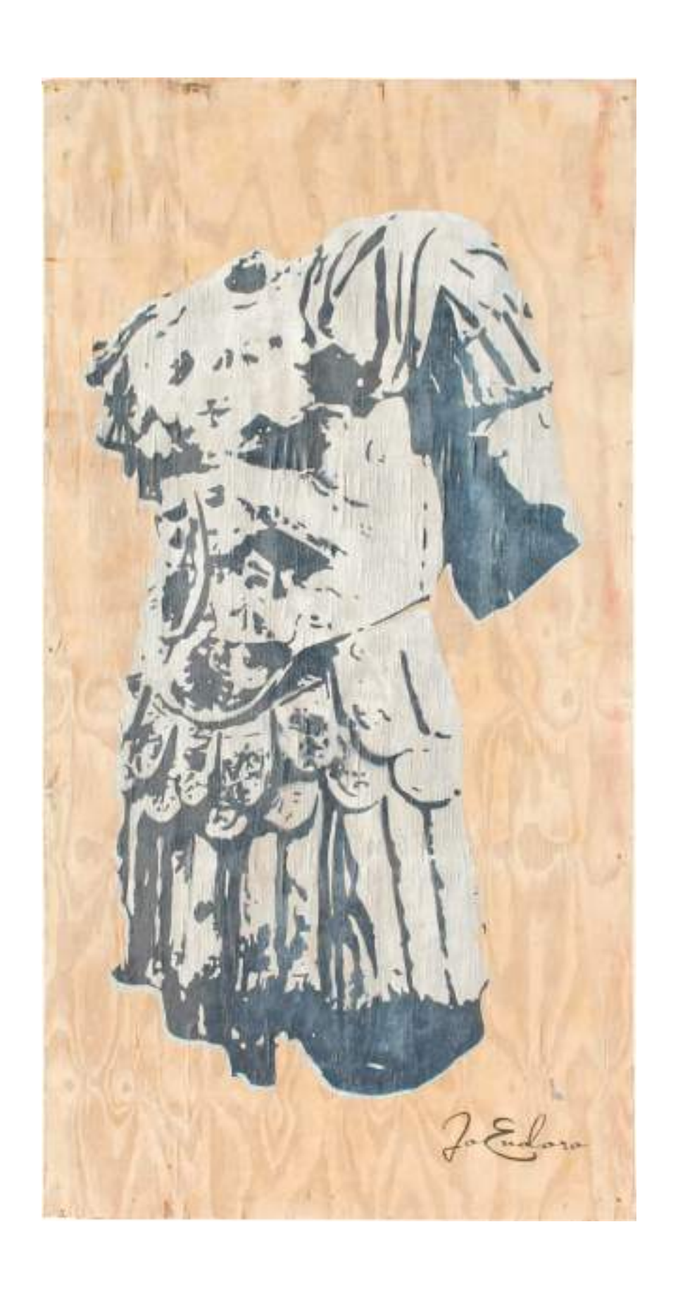
CESAR 2022 mixed on wood, 122x244cm #2022CDC510