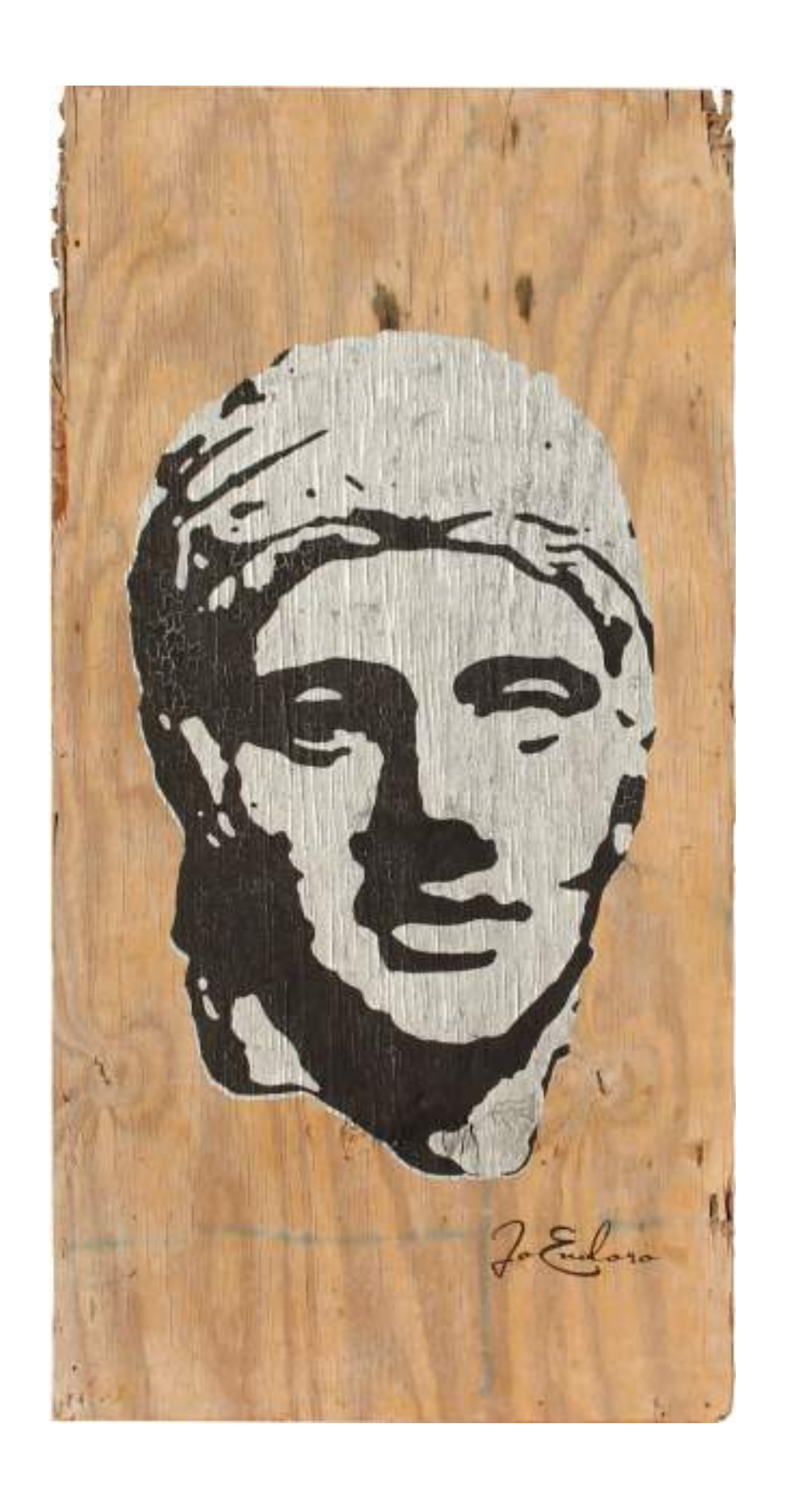
ARES 2022 mixed on wood, 122x244cm #2022CDC511