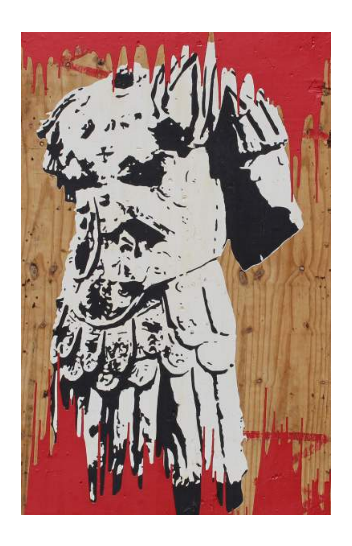
SANGUE E ARENA, 2019