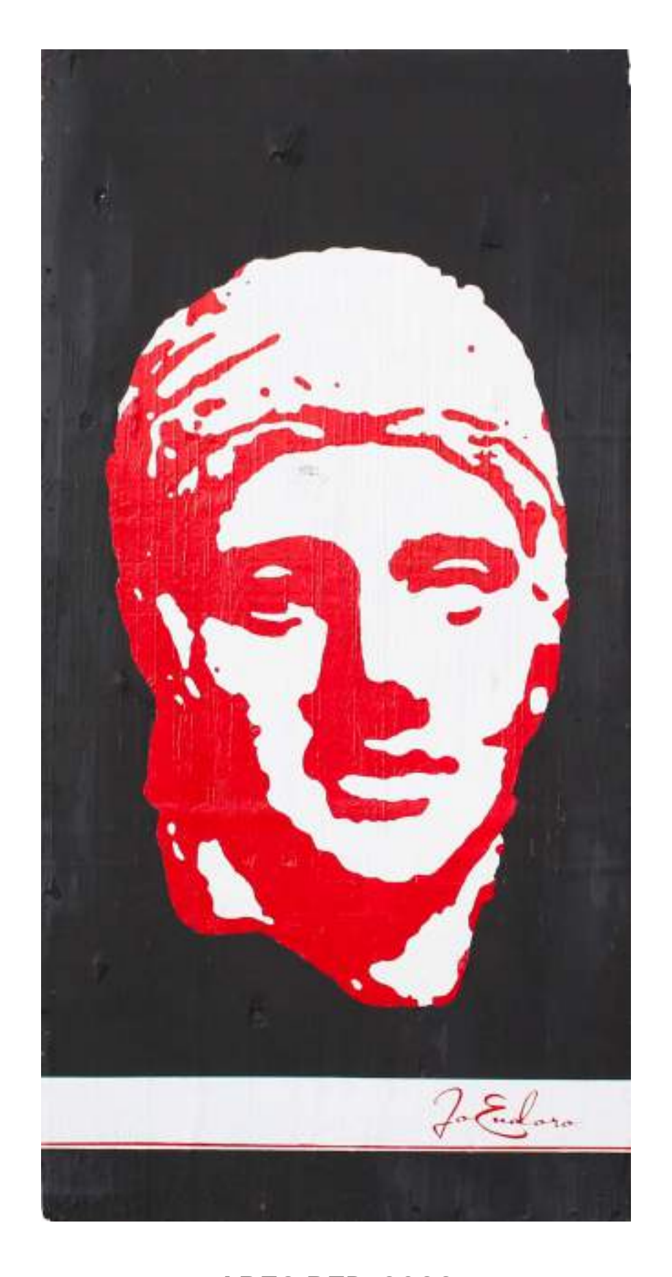
ARES RED, 2022 mixed on wood, 122x244cm #2022CDC507