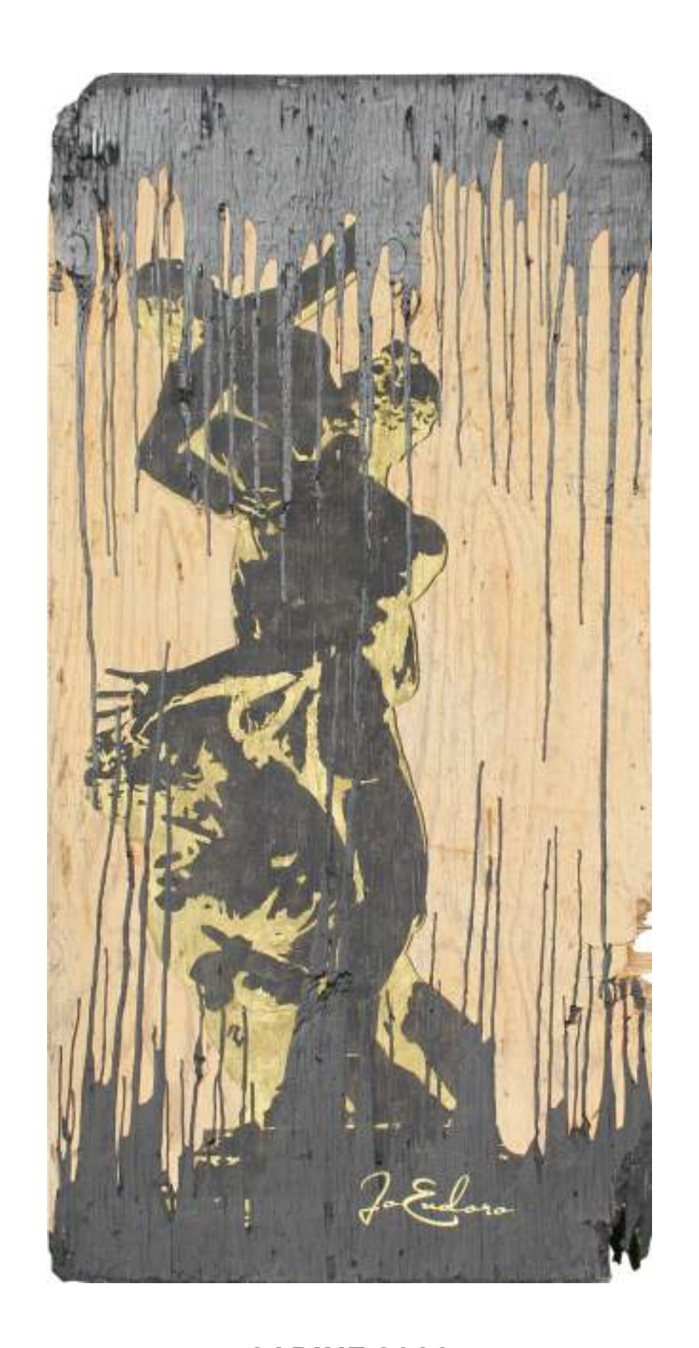
SABINE 2022 mixed on wood, 122x244cm #2022CDC512